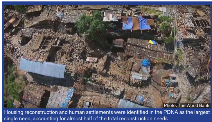
Housing reconstruction and human settlements were identified in the PDNA as the largest single need, accounting for almost half of the total reconstruction needs

On April 25, 2015, a 7.8 magnitude earthquake struck Nepal. Following a second strong earthquake on May 12 (7.3 magnitude), and a sequence of aftershocks, the Government of Nepal (GoN) reported the death toll at 8,700, while those injured reached 25,000. A Post-Disaster Needs Assessment (PDNA), completed in June 2015, found that total damages and losses amounted to about US$7 billion, with reconstruction needs of about