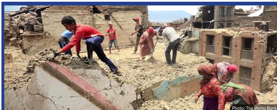
The program's objective is to restore and improve long-term resilience to rural housing damaged during the April and May 2015 earthquakes in Nepal using earthquake-safer building techniques and materials through an owner-driven approach while encouraging a culture of safer and sustainable housing and settlements.

Under the leadership of the Government of Nepal , the Earthquake Housing Reconstruction Program's implementation has been carefully structured to reflect the program's operating principles (mentioned above in Box 1) as well as the conditions on the ground. As shown in Diagram 1, there is both flexibility as well as regular monitoring and evaluation to assure that implementation is responsive to the needs of beneficiaries. Best practices have been gleaned from other international reconstruction experiences and incorporated into the implementation structure and procedures for the NHRP.